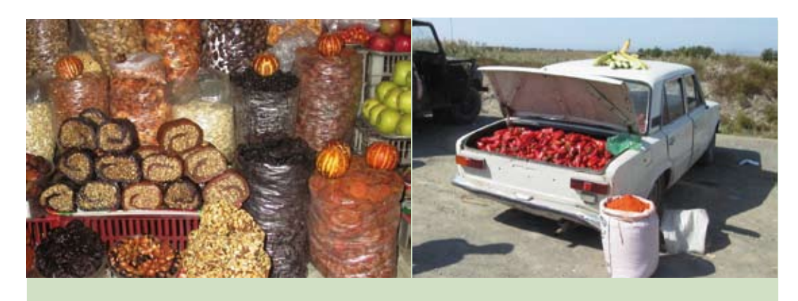
Armenia's rich diversity: dried fruit on sale in a Yerevan market and a car boot sale of peppers and paprika.

Armenia maintains a series of germplasm holdings; ex situ genebanks, in situ reserves, agro-ecosystems and protected natural ecosystems, working collections for research, breeding or teaching purposes, as well as information/documentation systems, as a result of