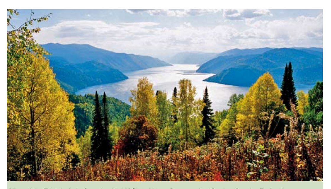
View of the Teletsky Lake from the Altaiski State Nature Reserve, Altai Region, Russian Federation.

The International Conference on the "Role of Forests in Climate Management: Research - Innovations - Investments - Capacity Building" took place on 4-7 October 2008 in St. Petersburg, Russian Federation. Organized by the Federal Forestry Agency of Russia's Ministry of Agriculture, the conference was attended by scientists, practitioners and forest managers from all over Russia, plus a few participants from abroad. The World Bank and FAO co-hosted the conference.