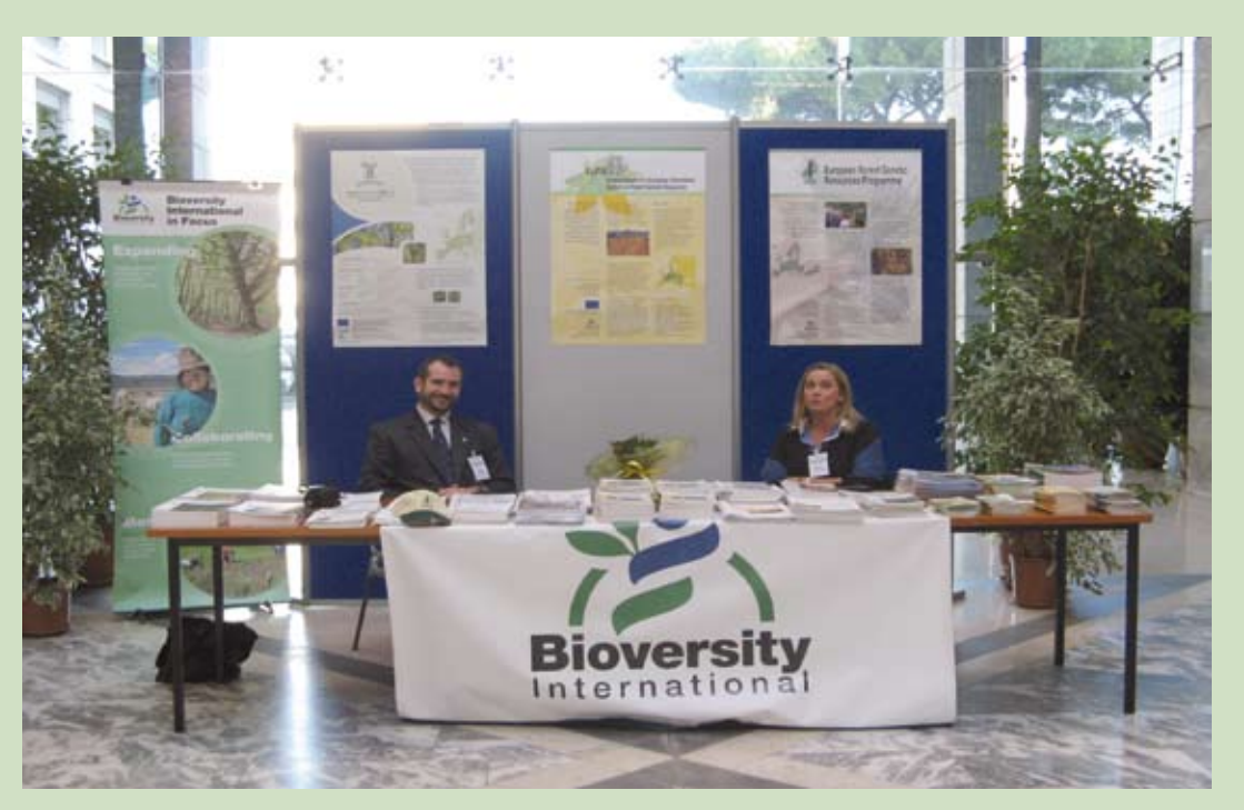
Bioversity International booth at the European Forest Week (FAO, Rome).

Bioversity International also set up a booth at FAO to distribute publications and display posters of EUFORGEN, EUFGIS and EVOLTREE. The presentations of the Bioversity side event are available at www. europeanforestweek. org/51336/en/. Further information on other events held during the European Forest Week can be found at www.europeanforestweek.org.