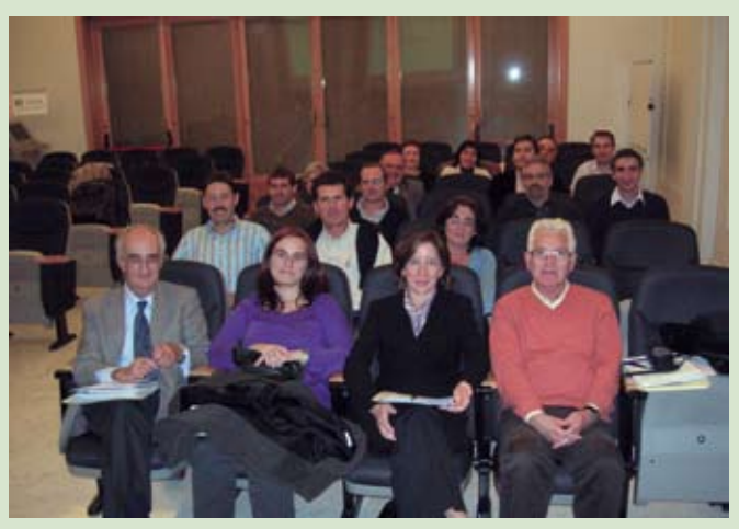
Participants of the EURISCO training-seminar in Madrid.

Further information on this training-seminar, as well as the agenda and outcomes, can be found at http://eurisco.ecpgr.org and will also be available in the next EURISCO E-Bulletin in December 2008. If you would like to receive the E-Bulletin, please register at http://eurisco.ecpgr.org/releases/e_bulletin.php.