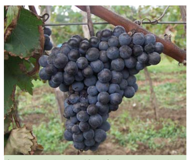
Grapevine production is one of Georgia's prime agricultural activities.

The Study emphasized that Georgia's rich agricultural legacy of traditional crops must be conserved and used to advance agricultural productivity in Georgia. Traditional varieties could be used to develop niche markets for the preparation of traditional foods, thereby providing new markets and generating income for local farm communities. Georgia is also rich in wild species, many of which are genetic relatives of cultivated plants and may serve as genetic resources to solve serious limitations in crop production, such as susceptibility to pests and diseases. It is essential to secure this rich biological resource indefinitely through a strong national, integrated and coordinated PGRFA management strategy. Considerable interest has been shown by the national authorities to follow-up on the Study. As in the case of Armenia, long-term assistance, cooperation and funding will be essential for the improvement and effective use of Georgia's PGRFA for food security.