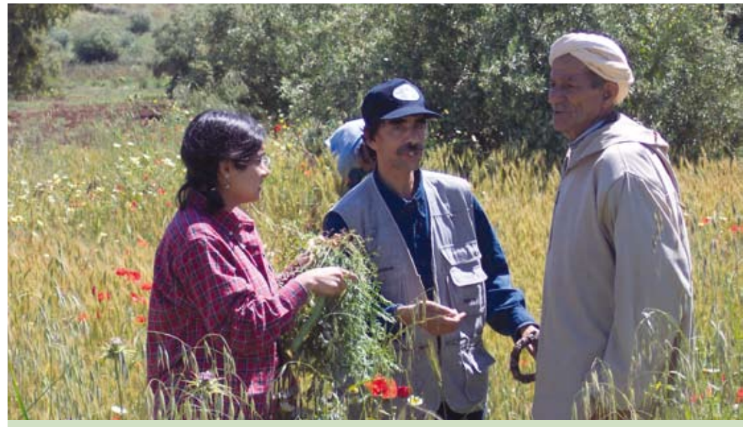
A student collecting indigenous knowledge from a Moroccan farmer during a Conservation Field Course.

The international reputation of the University of Birmingham in the conservation and utilization of plant genetic resources (CUPGR) is well established. Professor J.G. "Jack" Hawkes established the Conservation and Utilization of PGR (CUPGR) programme in 1969 and since then short course and master's degree training has been provided to over 1500 students from 92 countries - many Birmingham graduates now fill key roles in international, regional and national conservation agencies. We are very proud of our past graduate employment rate, with about 95% of our graduates obtaining employment in conservation (e.g. protected area management, seed conservation, conservation and genetic research and environmental monitoring) or related fields (e.g. agriculture, genetics, database administration, plant breeding, taxonomy, management and teaching). However, a recent periodic review indicated a growing requirement from trainees and potential employers for a greater research focus to the training and closer links with industry. To meet this demand the new