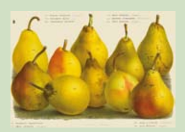
Illustration of a diversity of pears. Image: "Nos Poires", Ets Horticoles Louis Van Houtte, courtesy of J. Bosschaerts, Anvers-Antwerpen, Belgium

European fruit tree experts from Belgium, France, Germany, Hungary, Italy, Romania, Macedonia FYR, the Netherlands, Switzerland and UK subsequently analysed the DB accessions for Malus, Pyrus and Prunus with the objective of validating lists of synonyms, according to the best reference books for each crop, in order to identify the Most Appropriate Accessions (MAAs) to be included in the European Collection, currently being defined by the AEGIS initiative. They also checked the traceability of bibliographic encoded references.