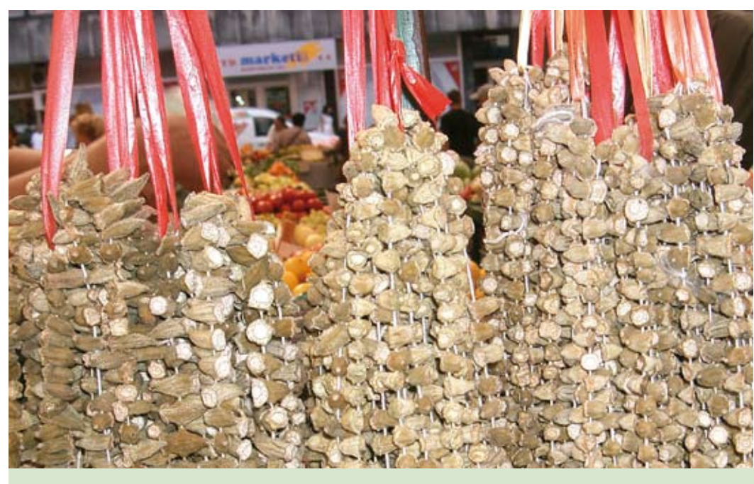
Dried okra (Abelmoschus esculentum) fruits sold at the vegetable market in Sarajevo.

We invite you to send your ideas and contributions for this Newsletter to Bioversity's Regional Office for Europe by Email to bioversity-europe@ cgiar.org. Please send all contributions for Issue 38 by 20 March 2009.