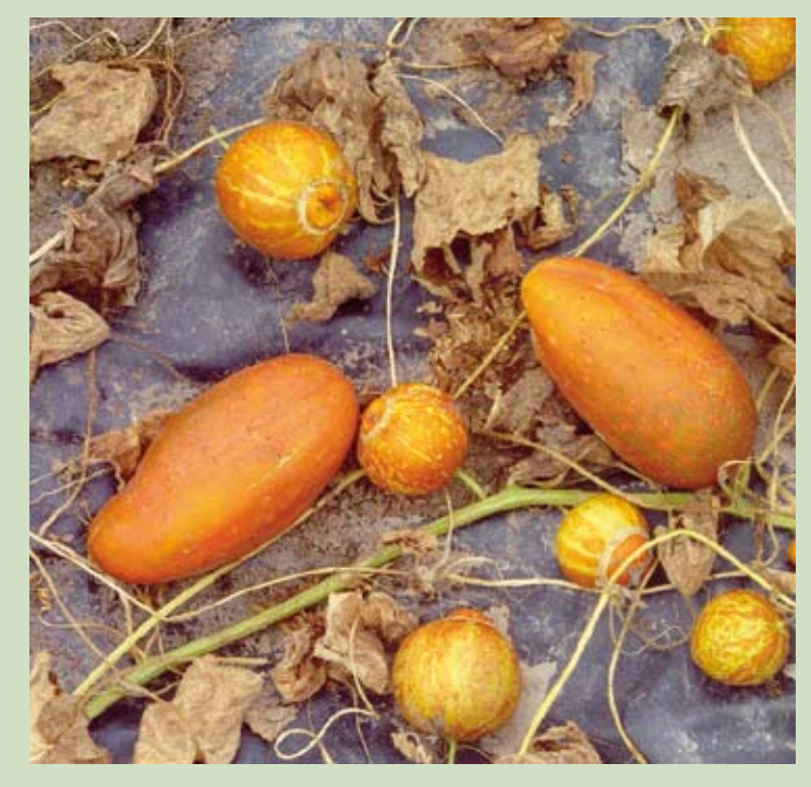
A selection of cucurbits from the Polish Cucurbitaceae germplasm collection.

The background, goal and scope of AEGIS, as well as the concept of the Most Appropriate Accessions (MAAs) and the role of the Working Groups in the implementation of AEGIS, were explained by the Chair and the Vice-Chair. Using the example of the