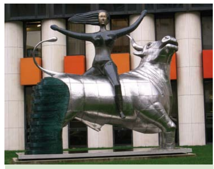
Statue symbolizing the Greek myth of Zeus and Europa, seated in front of the European Parliament, Strasbourg, France.

The outcomes of the workshop were presented by staff of the French Foundation for Research on Biodiversity (FRB) at the Conference of the French Presidency of the European Union "Biodiversity and Agriculture", Montpellier,