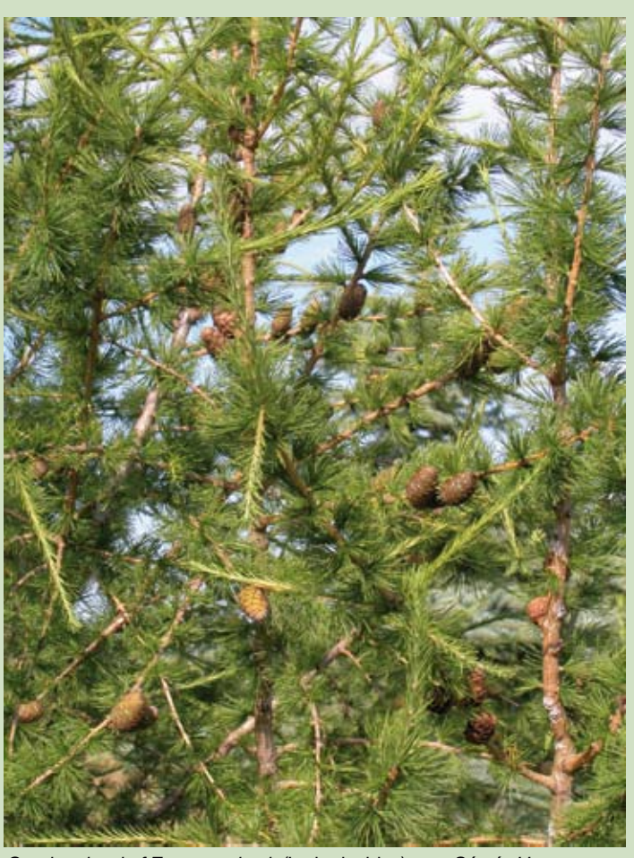
Seed orchard of European larch (Larix decidua) near Sárvár, Hungary.

The Network further discussed selection of genetic material for given site conditions and how climate change is expected to impact on this. In marginal environments in particular, the adaptive potential