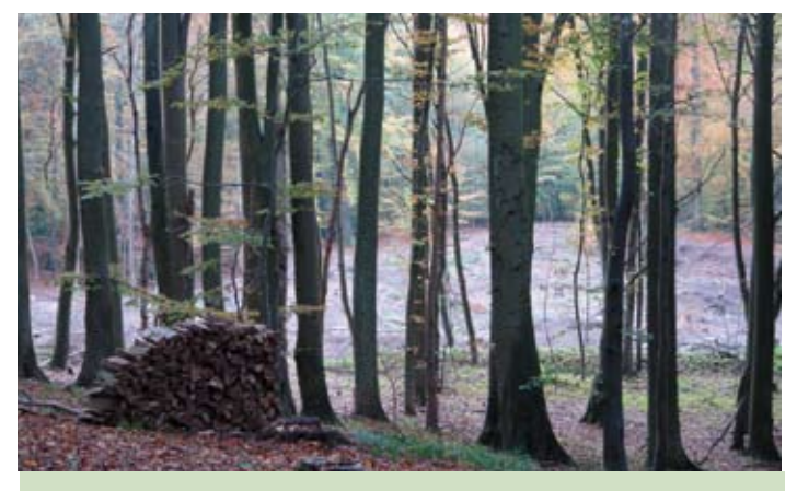
A corner of the Rude Skov forest in Birkerød, Denmark.

The principles of genetically sustainable forest management were mentioned during the Conference. Along with tree breeding and biotechnology, they are of particular importance in promoting the adaptation of forest