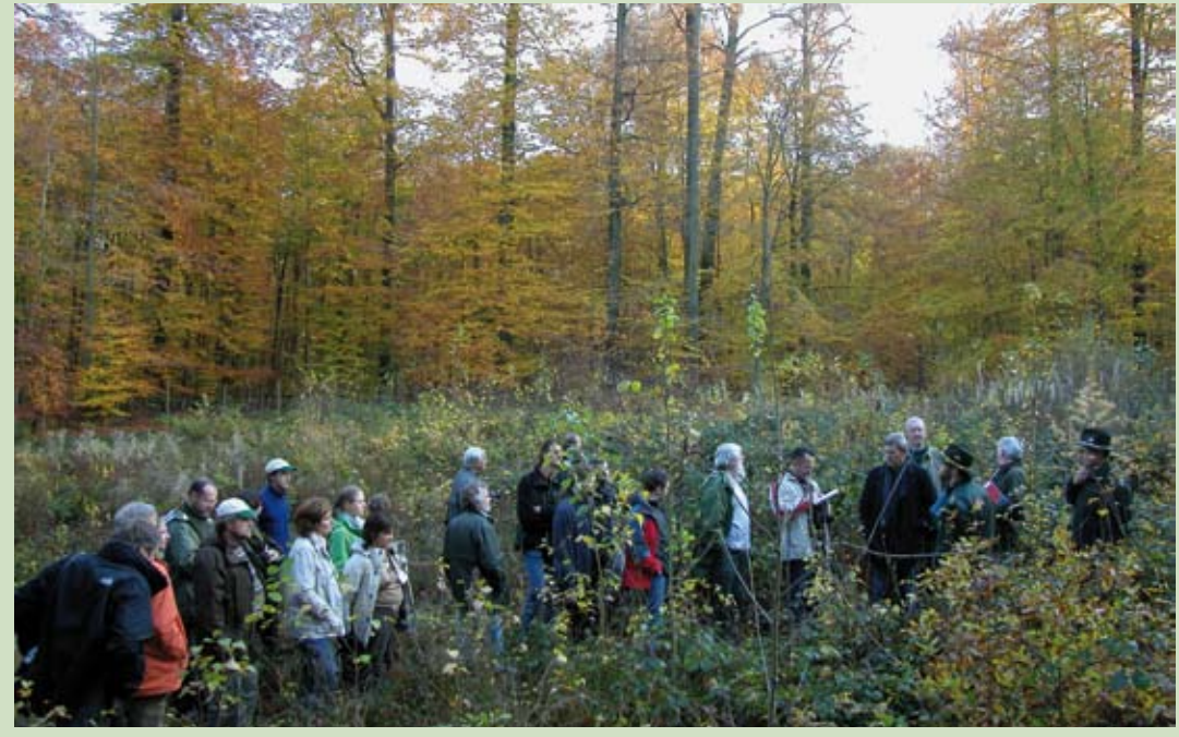
The meeting participants observing natural regeneration within a fenced plot in the Sonian Forest.

A summary report of the meeting is available at the EUFORGEN website (www.euforgen.org).