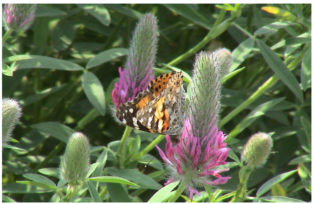
Trifolium rubens L.

Through successful project proposals prepared within the framework of ECPGR, it has been possible to leverage nearly \in 19m between 1996 and 2011. Most of the projects were funded by the European Commission through two GENRES Regulations (1467/94 and 870/2004).