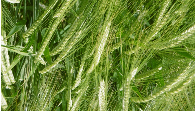
Hordeum vulgare L. – winter barley cultivar 'Fabian', accession N. 01C0502112, conserved in Kroměříž, Czech Republic