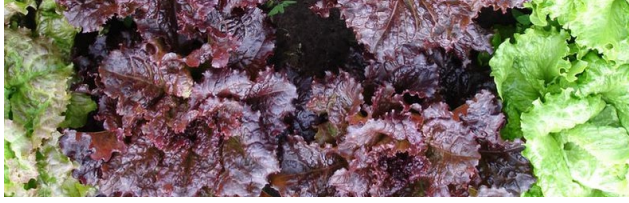
Lactuca sativa L. – cutting lettuce 'Ibis', accession CGN14606, characterization trial in 2008